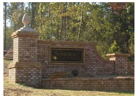
constructed sign monument , under BLD supervision