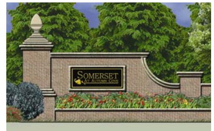
sign monument concept

If you would like to get BLD started on your next construction project, click here