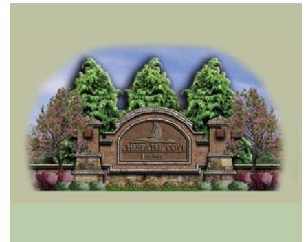
Typical Photoshop rendering of an entrance monument

If you are unfamiliar with SketchUp and its abilities, please see their website: www.SketchUp.com